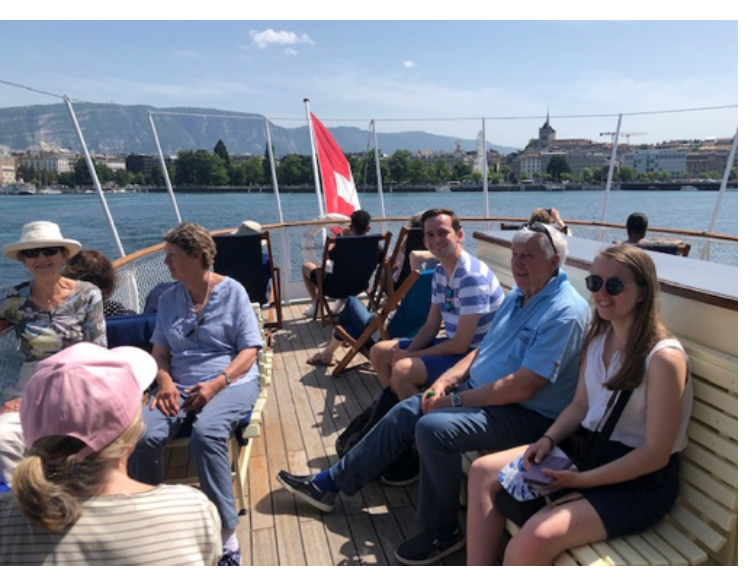
A hot day on Lake Geneva

sightseeing and a cruise on the lake, delicious traditional food and local wines at the restaurants, and a guided tour. Coincidentally, perhaps the best restaurant in Geneva is owned by a chef who started his career at the Mansion House, and he was delighted that a Livery Company was dining at his establishment.