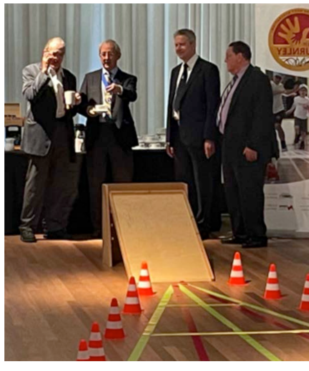
Primary Engineers day at Hall