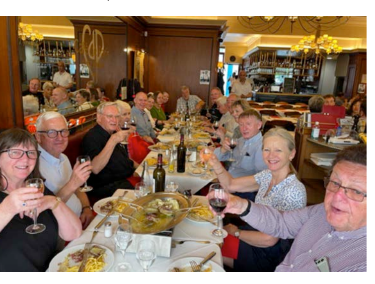
Some relaxation towards the end of the Masters' weekend

Our next Livery gathering was on the 25th July, with the Annual Church Service followed by a Court Meeting and Dinner in Hall.