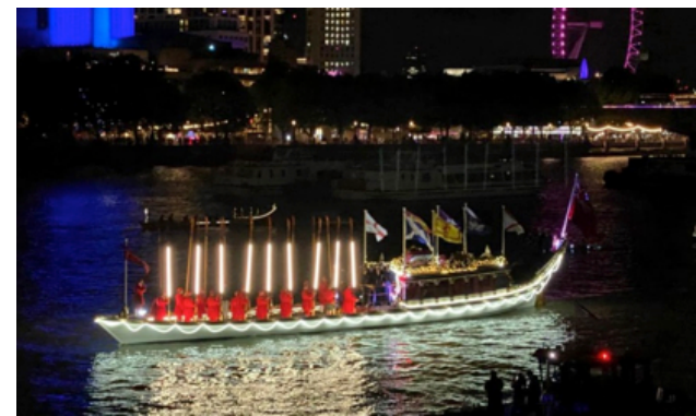
The Reflections Flotilla rows past HQS Wellington

One of the last events in my year was the Four Liveries evening. The four are the Clockmakers, Spectacle Makers, Lightmongers and Scientific Instrument Makers. One of the Companies arranges a talk or activity each year. This year it was the turn of the Lightmongers, who organised an October boat tour with dinner down the Thames. We enjoyed the food and wine, chatting with friends on deck, and looking from water level at the superb lighting of the Illuminated River Artwork's nine bridges.