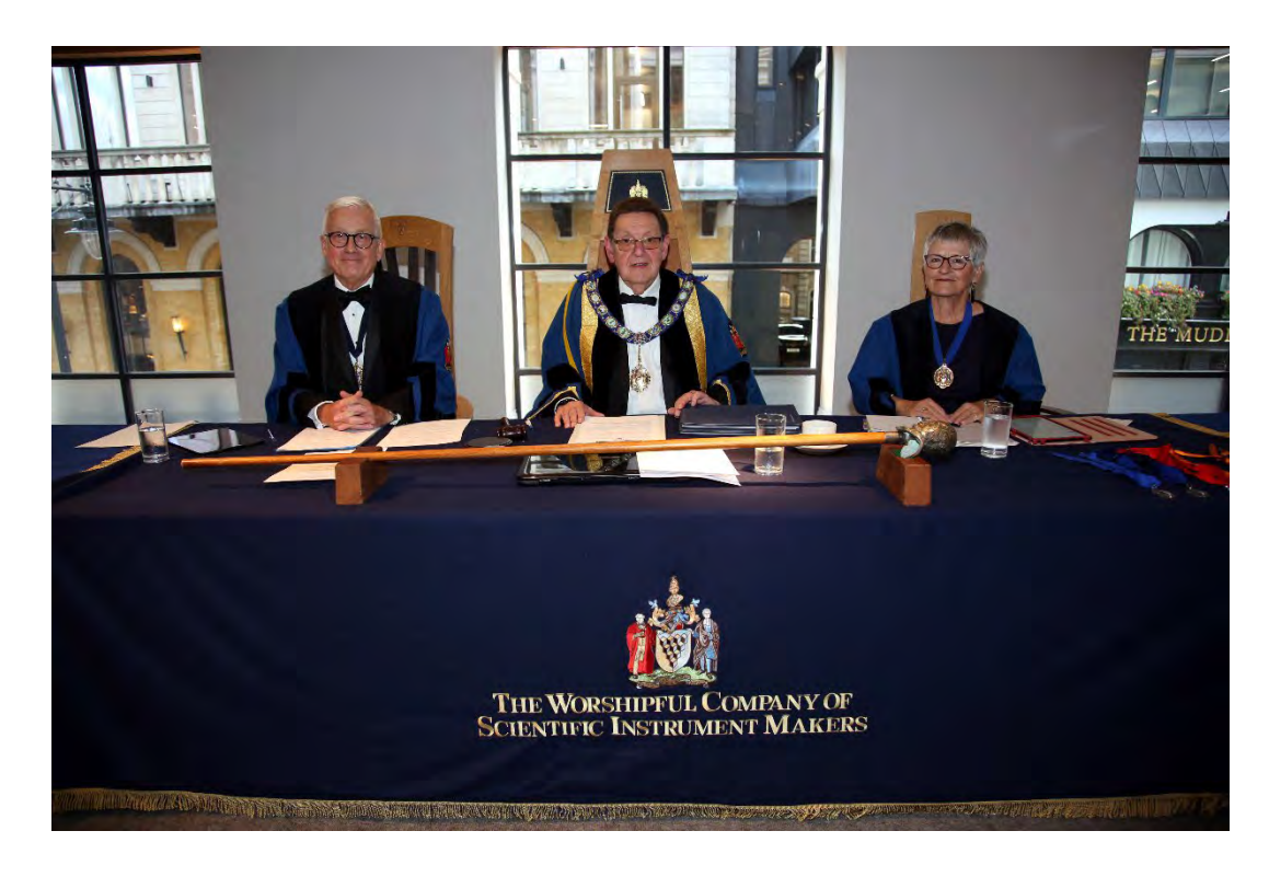
Figure 2 - Senior Warden, Master and Junior Warden